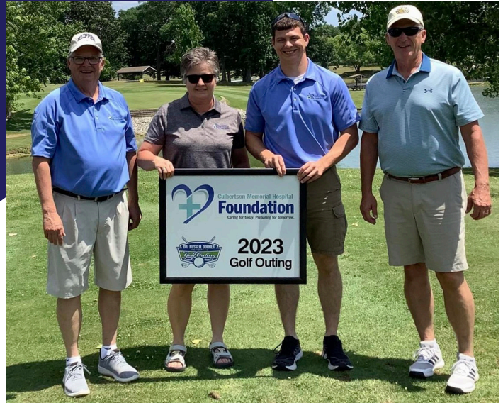
The 2023 Rushville State Bank golf team.

The Hospital is a tremendous asset to our area, providing